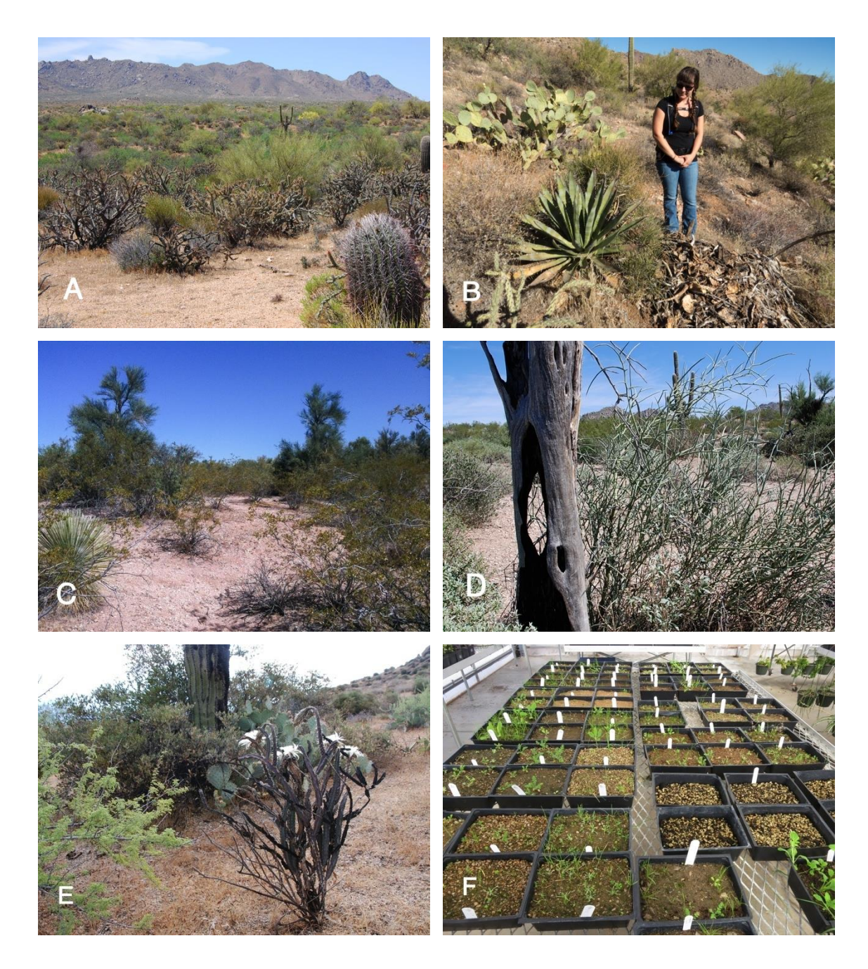
Figure 2. (A) McDowell Mountain range in the background with Pinnacle Peak Pediment in the foreground, looking southwest from near McDowell Mountain Regional Park boundary. (B) Agave murpheyi on eastern slope of McDowell Peak; single large plant and several smaller ones, with numerous old remains. (C) Tree-like Canotia holacantha on caliche exposure south of Cholla Mountain. (D) Tube-like woody remains of Canotia holacantha burned in 1992 Granite fire. These were common in burned areas where C. holacantha grew. (E) Many Peniocereus greggii var. transmontanus like this one were left exposed by the 1995 Rio fire. (F) Greenhouse trays one month after planting.