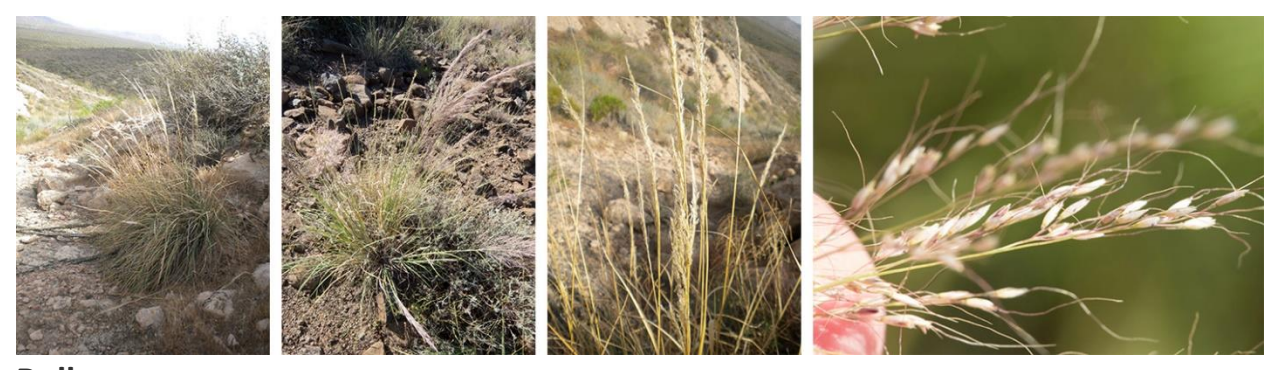
Bullgrass Muhlenbergia emersleyi

The plant is over 1 meter tall, with leaves to 50 cm long; leaves can be flat or folded, 2 to 6 mm across. Flowering and fruiting heads are dense with some reddish color. Short, fine awns on the seeds give the inflorescence a feathery appearance.