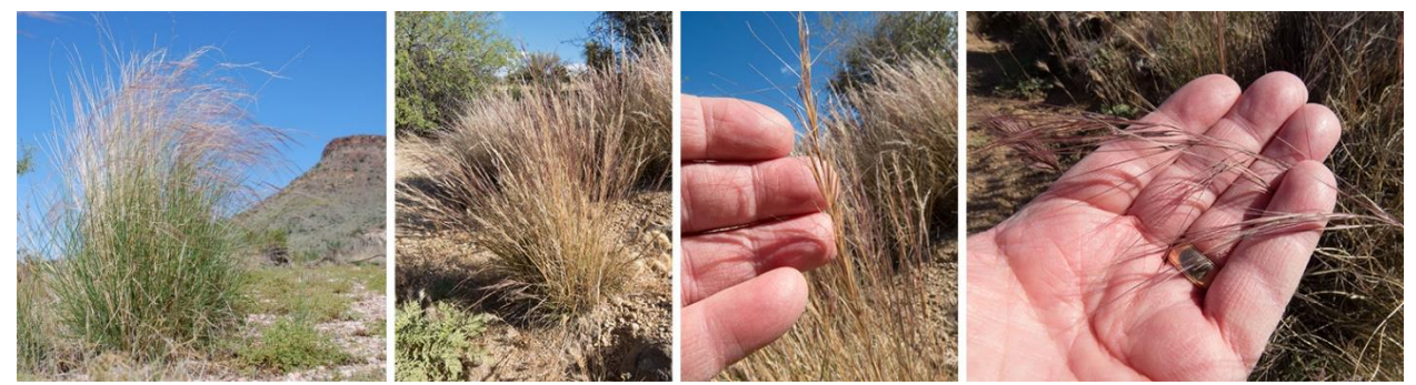
Purple Three-Awn Aristida purpurea

The mature plant is dense with many leaves and inflorescences. Leaves are 25 cm long and 1 to 1.5 mm wide. Purple three-awn has feathery inflorescences; Parish's purple three-awn inflorescences are stiff. Flowers and immature seeds have three awns parallel to each other; with maturity the awns spread by twisting a bit at the base.