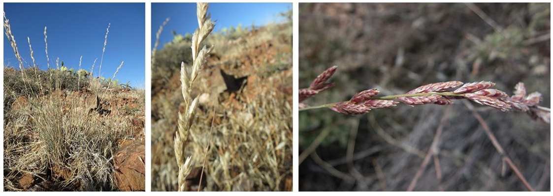
Slim Tridens Tridens muticus

Small to medium-sized, open bunchgrass to 80 cm tall. Leaves narrow, 1 to 4 mm wide and usually rolled or folded. Spikelets alternating from one side of the flowerstalk to the other (see photos). Flowers and seeds have some red-purple coloration and short hairs.