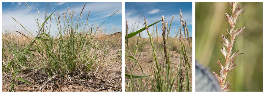
Curly Mesquite Hilaria belangeri

Small perennial plant about 35 cm tall. Leaves are short, 3 to 15 cm long and 1 to 3 mm wide. It reproduces by seed as well as by above-ground stolons (also called runners). The flowerheads have some purple coloration. Large, spreading bracts below the seeds help with the ID, as well as with its cousin big galleta grass.