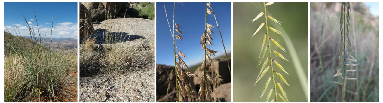
Sideoats Grama Bouteloua curtipendula

Medium height plant to 80 cm tall. Leaves are 30 cm long and from 2.5 to 7 mm across. Flowers and seeds are borne along one side of the inflorescence, a distinct character in this group. Old flowerstalks often show the points of attachment along one side of the stem. Flowers often have some red-purple coloration. Most common on north-facing slopes and boulder piles.