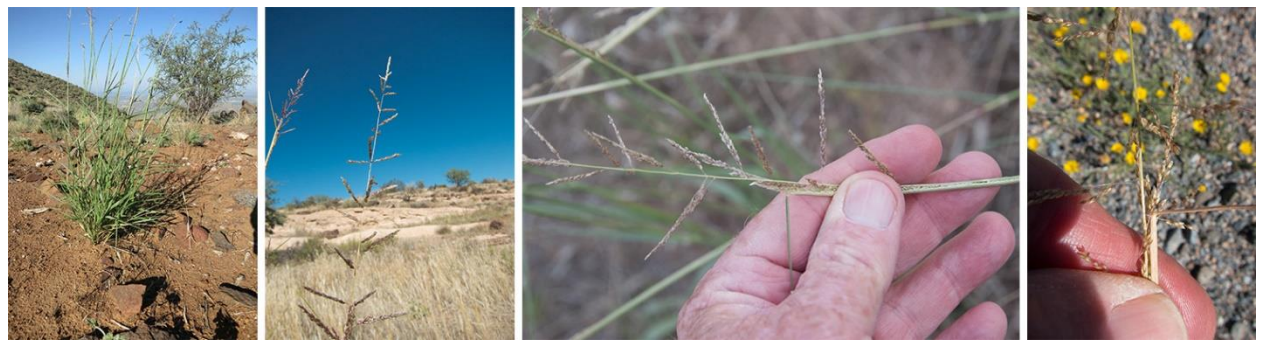
Sand Dropseed Sporobolus cryptandrus

Typically found at higher elevations and moist areas. Open plant to 1 meter or more tall. Leaves 5 to 25 cm long and 2 to 6 mm wide. Flowerstalk with right-angle branching and a long-pyramidal shape. Seeds large, rounded, about 1 mm long. Some red-purple coloration in the seedhead.