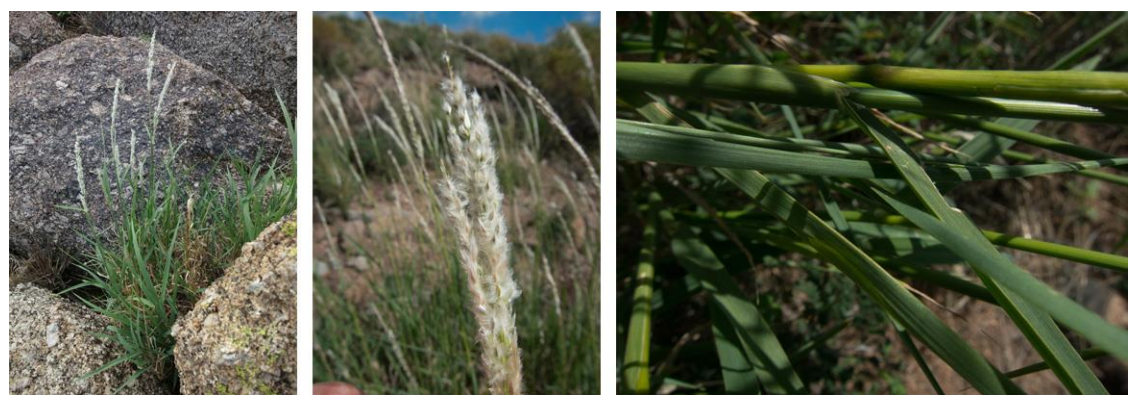
Arizona Cottontop Digitaria californica

Bunchgrass to 1 meter tall with conspicuous white seedheads, these with 4 to 10 finger-like branches atop a long stem. Stem is often bent at the base. Short leaves 2 to 12 cm long and 2 to 5 mm across. Seed 3 to 5 mm long with dense white hairs. Usually found on north slopes and in boulder piles.