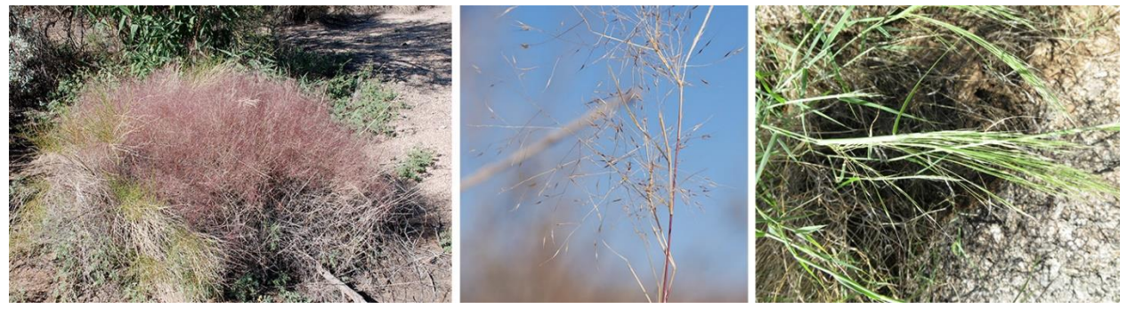
Bush Muhly Muhlenbergia porteri

Bushy, weak-stemmed grass often growing with support of shrubs. It can reach 1 meter tall or more. It is a very fine, feathery plant. Leaves are short, 2 to 8 cm long and 0.5 to 2 mm wide. Fresh growth is green, but it turns red-purple with time, fading after maturity to beige. The inflorescence branches stiffly at right angles from the stem; flowers and seeds are found at the ends of long stalks.