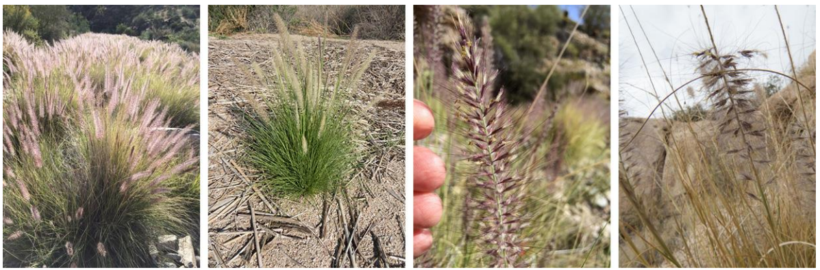
Fountain Grass Pennisetum setaceum

How to ID: Wide leaves; spikelike inflorescence; bristly flowers; when dry, yellowish coloration from a distance