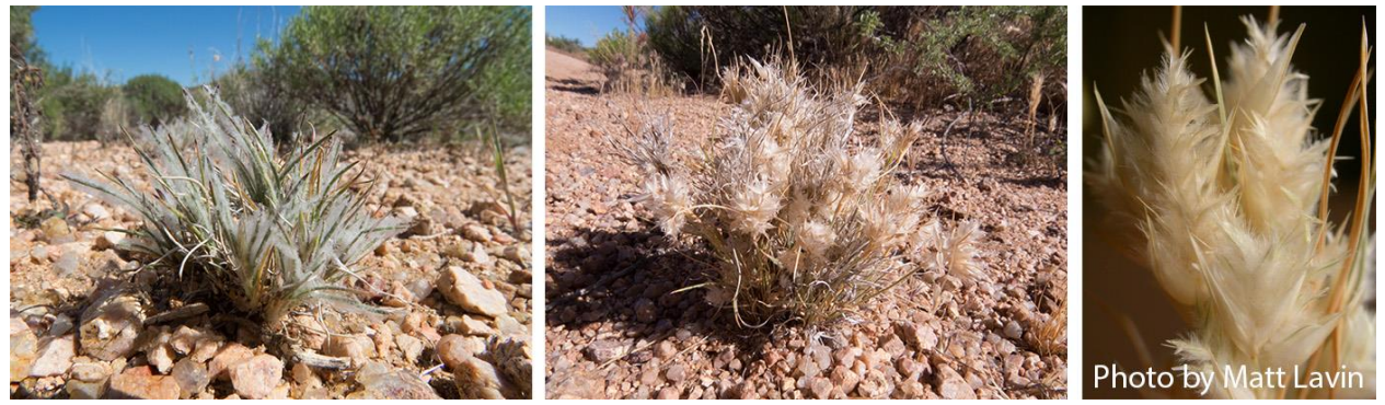
Fluffgrass Dasyochloa pulchella

How to ID: Fine-leaved grass with rolled leaves smooth to the touch